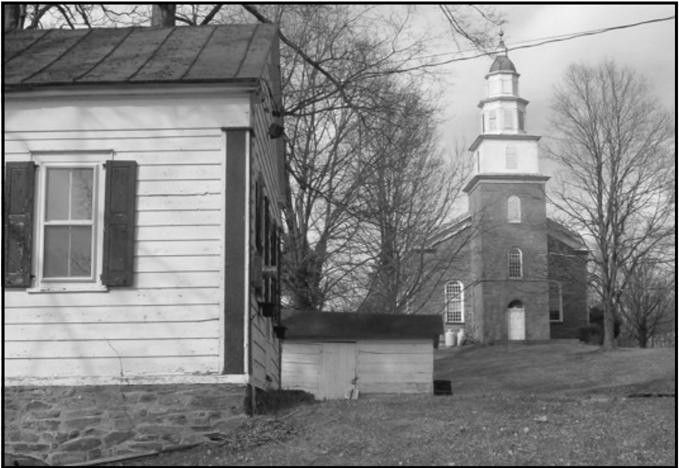
The Old Stone Church yard with its school building on the left and the outhouse in the center